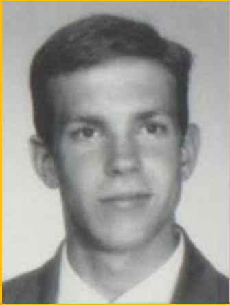
Shawnee Misson West Class of 1994