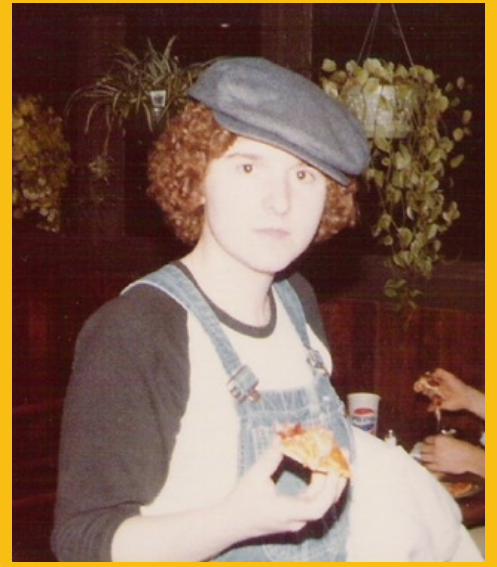
Leavenworth High School Class of 1979