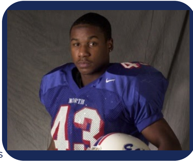
Wichita Southeast Class of 1969