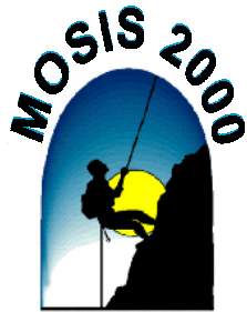
In The Natural State

Northwest Arkansas Holiday Inn and Convention Center Springdale, Arkansas 501-751-8300